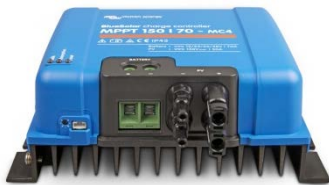
Solar Charge Controller MPPT 150/70-MC4