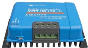
Solar Charge Controller MPPT 150/70-Tr